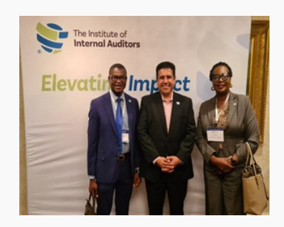
2022 Global Assembly of The Institute of Internal Auditors (IIA)